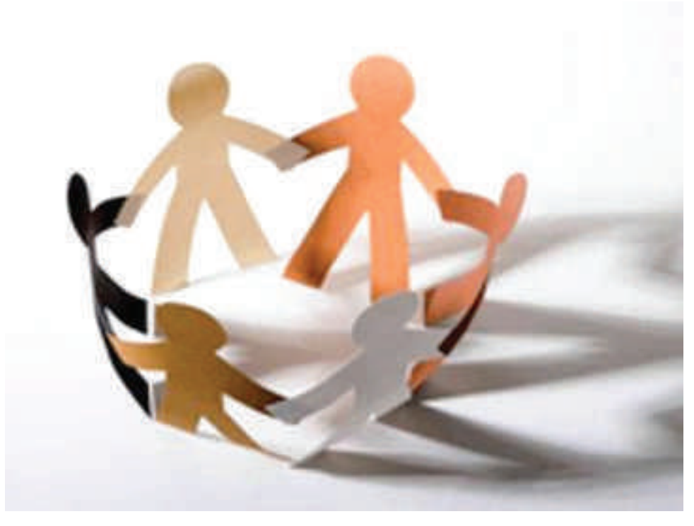
By Zenitha Prince

Special to the Trice Edney News Wire from the Afro American Newspaper